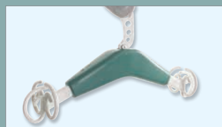
Tri Hook Yoke