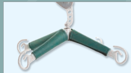
4 Point Yoke