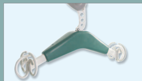
Tri Hook Yoke