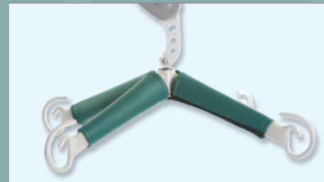
4 Point Yoke