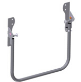
CPR Layflat Bar