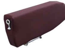
Standard Removable Arm