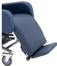
Deluxe Legrest (With Fold-Away Footplate)