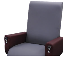
40 Standard Series (without wings)