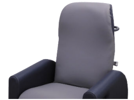
50 Bahama Series