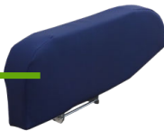
No Meal Tray Arm