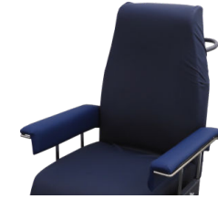
45 Euro Series