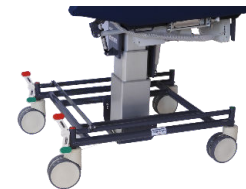
Central Lock Base