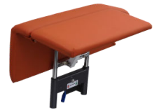
Procedure Tray Arm