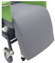
Standard Legrest (No Footplate)