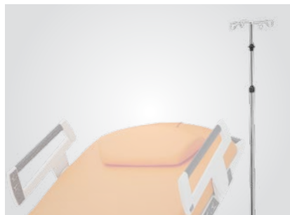
Telescopic infusion stand