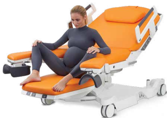
Half sitting using foot section