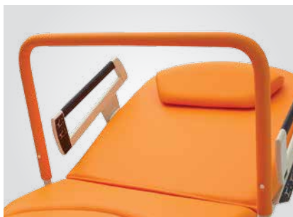
Supporting upholstered bar