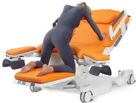
All fours position