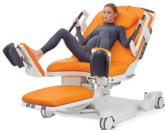
Semi recumbent position with the feet rested on the leg rests