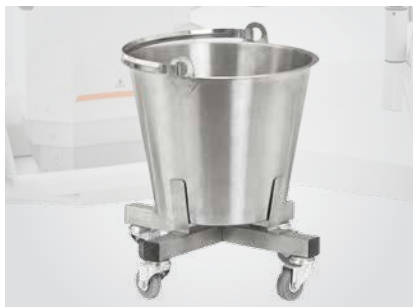
Stainless steel bowl with castors