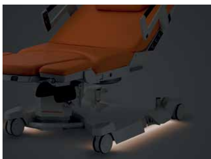
Under bed light