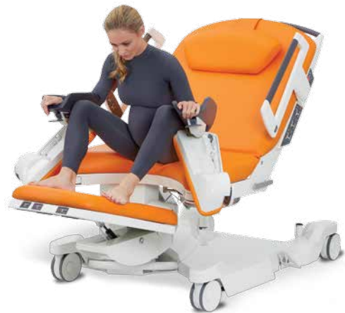
Half sitting using leg holders