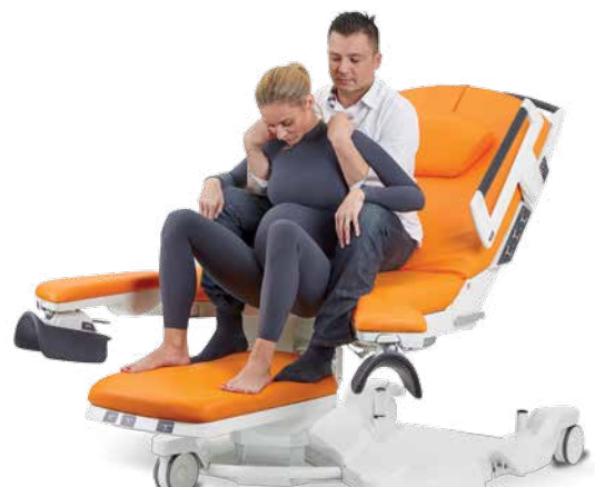
Half sitting with partner assistance