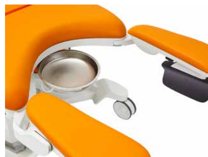
Sliding stainless catch basin 4.5l