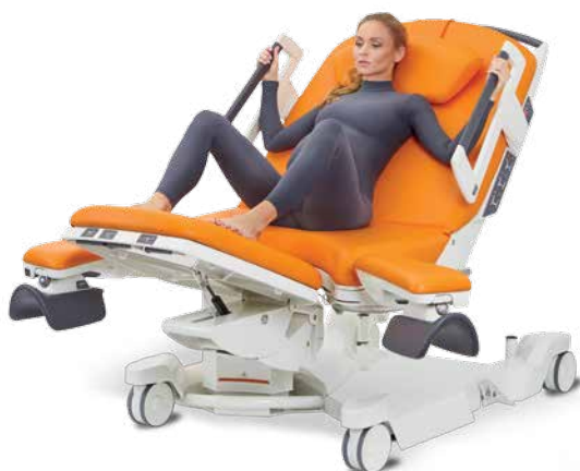
Semi recumbent position with the feet rested on the foot section