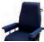
45 Euro Series