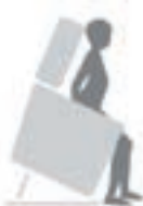
Lift to Stand