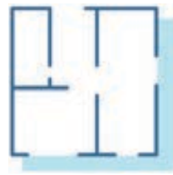
Reconfigure spaces in seconds