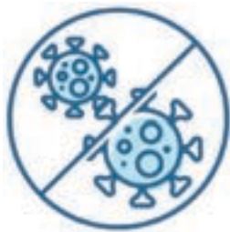
Reduce the spread of infection

KwickScreen is a versatile solution for all environments, not limited to healthcare settings.