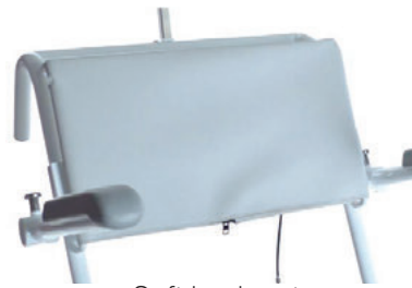
Soft backrest for M2