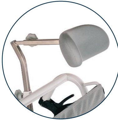
Height & depth adjustable, short bar & super soft