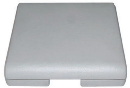
Cover / Lid