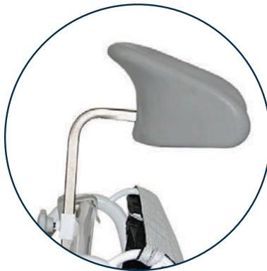
Height and width adjustable