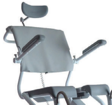
Soft backrest for M2 Multi-Tip