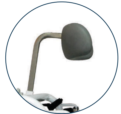
Height adjustable, super soft