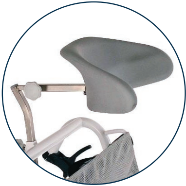
Height, depth & width adjustable, short bar